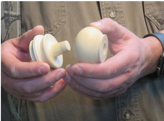
Jam Chuck by Dick Hicks to make final cuts on globe