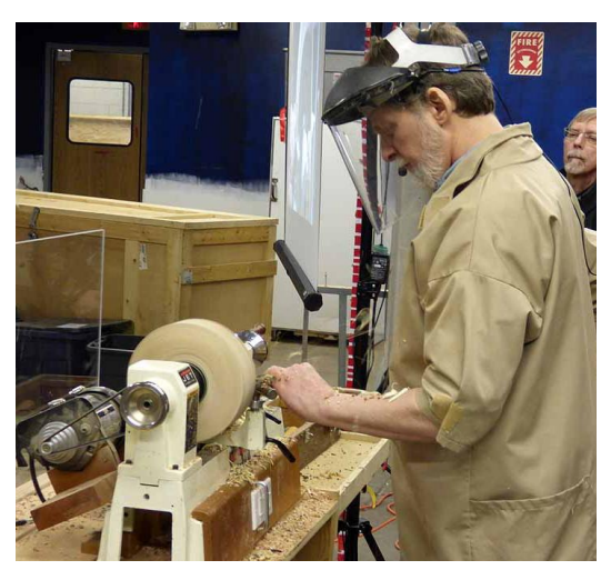
At the end of the day, almost every attendee bought pizza for lunch and five people joined the MWA. One response from a first time visitor is typical:

"I attended the class and got real info that I intend to use. Now to convince (my wife) that I can buy that new machine. The guys sitting around me were very helpful and a great group of fellas."