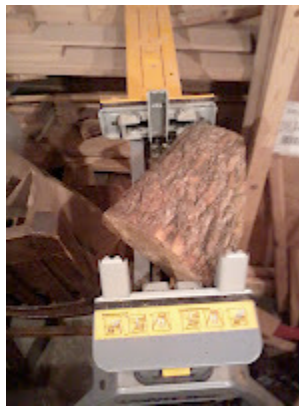
One corner cut off.