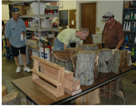
Members checked the supply of donations for the wood raffle that would take place at the end of the meeting.

Added to these activities was a food table provided by the club that allowed members to have their dinners and watch the activities at the same time. The food was topped off by a cake that offered thanks to Gary for providing meeting space over these past few years.