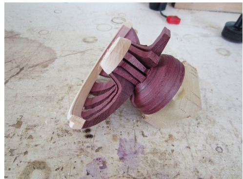
photo that it took more than one attempt to complete the cover. The book Segmented Wood Turning by William Smith gave me the inspiration and guidance to turn the box cover. The vase shown in the photo is also featured in that book.

I learned woodturning from some talented fellows while spending our winters in an RV park in Casa Grande, Arizona. The covered segmented box in the picture is the one that was awarded 2nd place at the April MWA meeting. You can see from the other