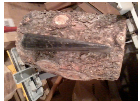
My splitting wedge. Its almost impossible to hold this upright with my left hand and be able to pound on it. Wood underneath is a blue spruce.

tightly enough to hold the chisel. My spastic wrist curls in, pulling the blade out of the kerf, my spastic pecs pull the whole arm away from the block of wood. When I finally get them buried I get out the 3lb. splitting maul and try to hold that upright while I use my 2lb. hammer on it. So far no smashed fingers or hand. Lots of swearing though.