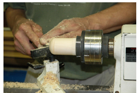
Jim Jacobs sanded the box with the tight fitting lid attached.