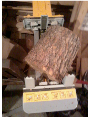
What the wood looks like when clamped in.

which you can use its ratchet clamp on your piece of wood to hold the wood while you use a hand bucksaw to cut off the corners.