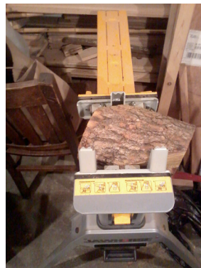
Two corners cut off.

For some of my wood I have 12" logs that first need splitting. I stand them upright in the JAW-horse and cut a 2" deep kerf to start the splitting process. My splitting wedge has a very blunt end and in order to use it I first have to drive 2 wood chisels