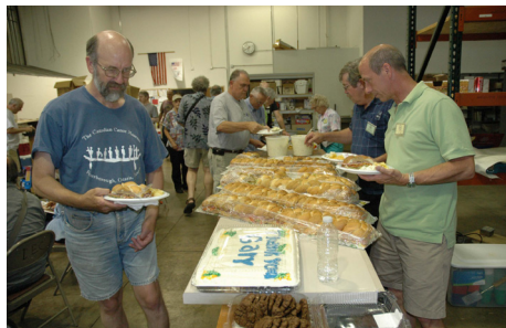
Food for this event, which substituted for the regular summer club picnic, was furnished by the the MWA.