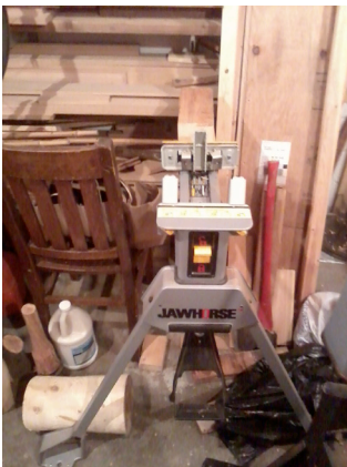
JAWhorse. 3 legs, the jaws ratchet closed with the foot lever. Yellow button locks the jaws in place.

I do bowl turning partly because I can use a faceplate that I screw to the piece of wood. Spindle turning, using small diameter pieces and centering them between the headstock and the tailstock, is almost impossible. You need to hold the piece of wood steady with one hand while the second hand slides the tailstock to tighten the piece down. If I had access to freshly cut wood it would be so much easier. Green wood turns much easier and sprays you with water/sap as you are turning. The objective in turning green wood bowls is to leave a substantial side wall thickness so after they dry into oblong shapes you still have enough material to make them round again. I however have to use dried half logs. In order to get them rounded down the easiest, you normally would take them to a bandsaw and rough cut them to a round shape. Bandsaws at best require two useable hands to push the wood through the blade. I don't have two useable hands, or a bandsaw, so I punted. I bought a JAW-horse,