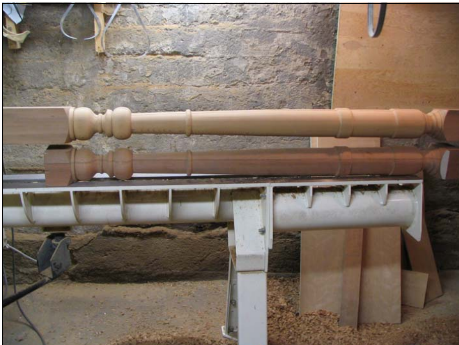
Solid laminated redwood 9' column turned to the profile of the master blank. The solid 9' column was turned on a Oneway 1640.

The image below shows the two original paint lines of the backer board at porch level for the original half column. The paint line from this backer board was interpreted and a master column was made to a length of 5'. The 5' master column was split and nailed with square lengths applied. ( A porch has been made and the 4 columns have been installed.)