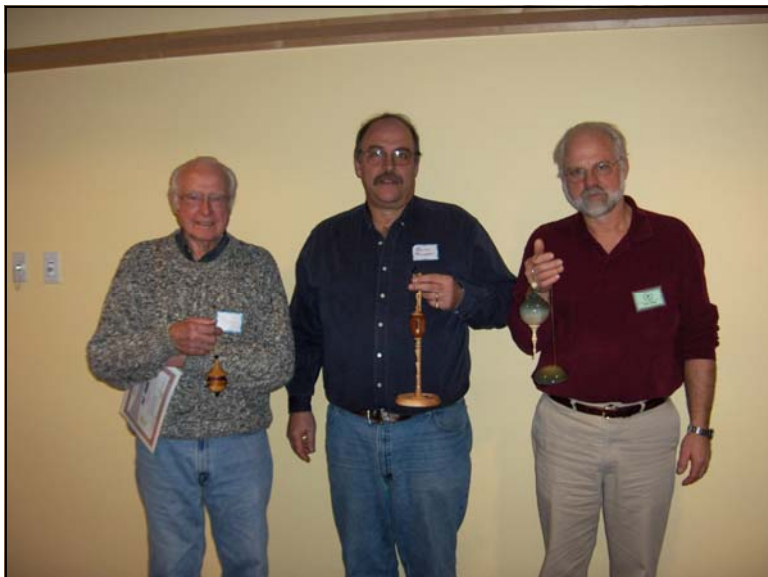
Ornament challenge winners: