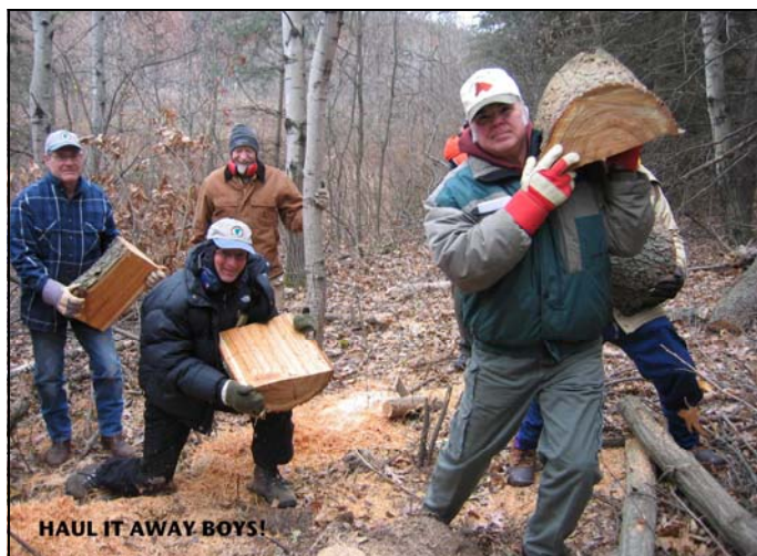
HAUL IT AWAY BOYS!