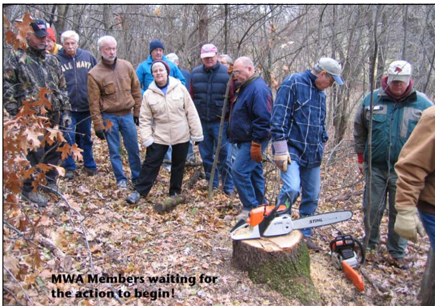
MWA Members waiting for the action to begin!