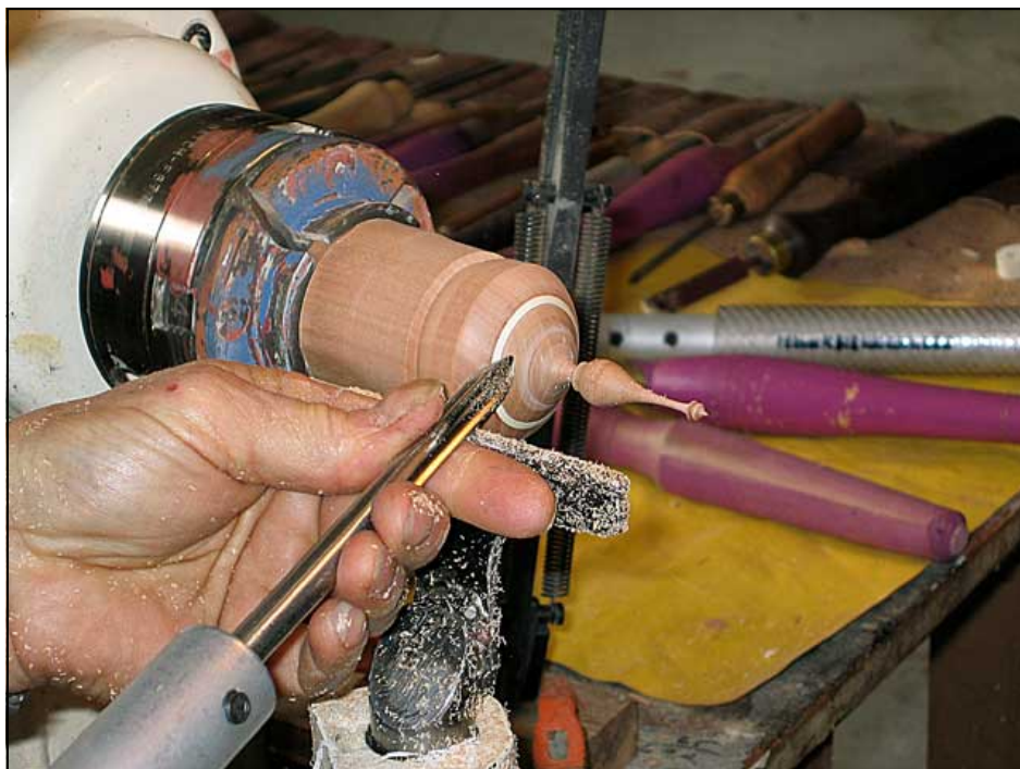
Close up of Cindy's finial box