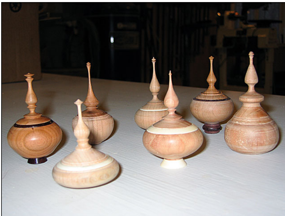
A days work for hands-on session attendees