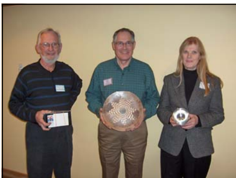
2006 Raffle winners

It is impossible to mention all the great food and a thank you goes out to each member. The choices included many main courses, along with a healthy selection of salads, offset by some very good desserts. A special thank you to the persons who brought the BBQ, the meatballs, and the chocolate deserts.