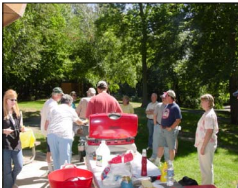
The annual picnic has become one of the highlights of the year.

The following will be provided: Grills, beverages, condiments, plate, napkins, eating utensils and sweet corn!