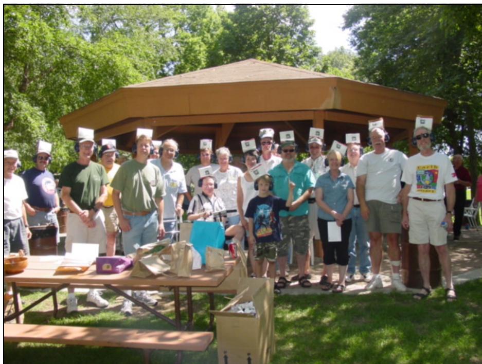
The "group" showing off there new ear protectant muffs donated by 3m at the 2005 picnic.