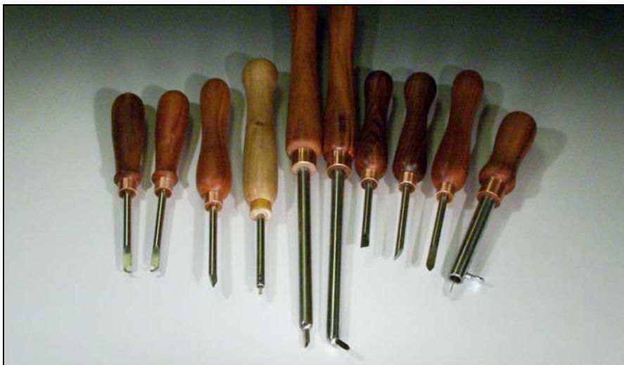
Some of the tools that will be available for you To make at this years tool session.

Eye protection, spindle turning tools for making handles, vise grips, dremel style tool and extension cord, cone live center #2 taper, sandpaper, hand files, $ for pizza, wood for raffle and turning tools you would like help sharpening