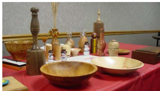
Many different turnings were represented for the gift exchange