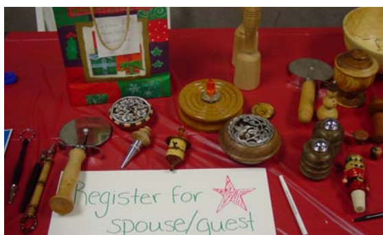
The door prizes for guests/spouses was a big hit with all guests receiving at least one gift