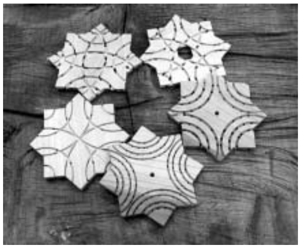
Examples of Brian's stars