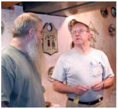
"I had a great time Saturday. The concept of one on one works great for me. I learned a lot.

Making pens isn't as easy as it looks. You need to pay attention or it wouldn't work. I had a great host and instructor. THANKS."