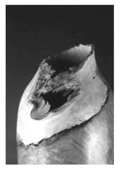
"Stratum Sphere", 1999. Spalted Sugar Maple. 6" "Vessel", 1989. Redwood Pitch Burl (top detail). 38"h x 11"d "Homage Pot" 1999. Spalted Sugar Maple. 13"h x 10"d

Because the sphere is such a universal form, making them becomes an extraordinary design challenge...Within these simple forms, one can draw elements of power and repose, gesture, texture and self-expression. Thus through these objects, one gains a true sense of the 'pulse' of the creative process.