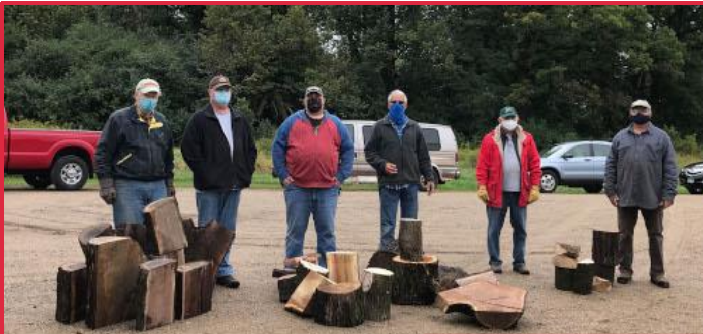
First raffle winners