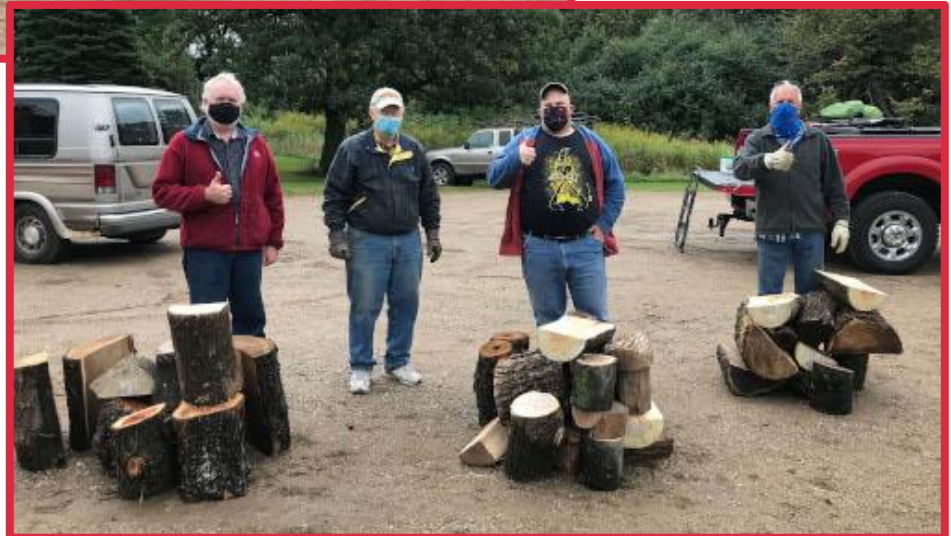
2 nd raffle