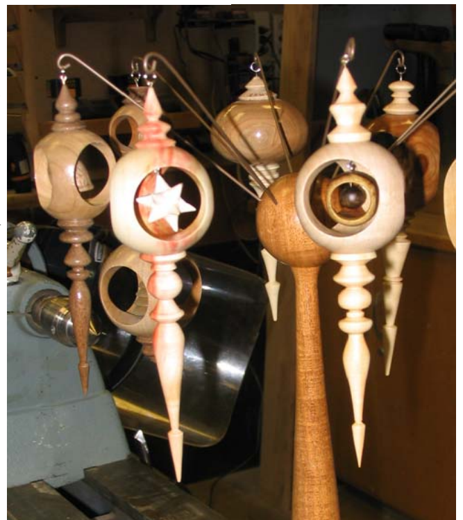
Some samples of Erwin's Ornaments, notice the “windows” in the globe and the hanging miniature ornament.

ment to hang on the inside to be viewed through the open “windows”. With the mini ornament being so small, that is probably the hardest part of the hole ornament but the small details really make the difference.