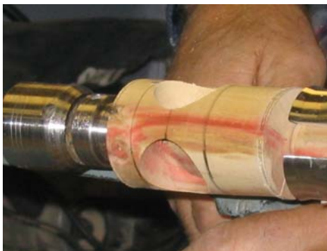
The globe cylinder with 3 “windows” drilled into the sides ready to begin shaping the globe.

At the November member meeting we were presented a great project by Erwin Nistler. A globe style ornament that was not hollowed but had open sides “Windows” into the interior of the ornament allowing a tiny figure to be hung and viewed on the inside. Erwin starts this project by turning a cylinder and then drills 3 evenly spaced holes around the perimeter. Erwin wraps a piece of masking tape around the cylinder