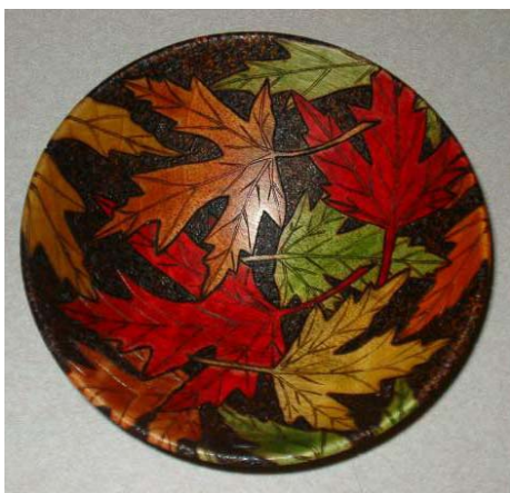
One of Andi's finished pieces, check out the website to see the beautiful colors and details!

can find the time. She creates artistic pieces that are in very high demand. She copies leaves, vines and other natural plant parts to create her unusual pieces. She has devel-