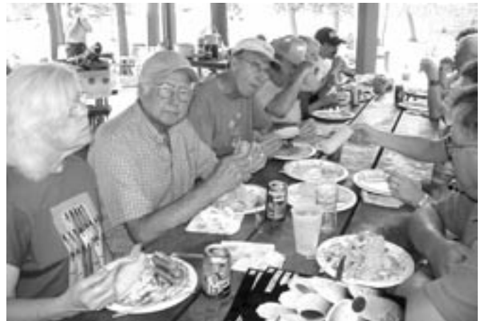
The pot luck lunch along with many family activities make this a pleasant day in great surroundings.

Suggested: lawn chairs, lawn games, bug spray