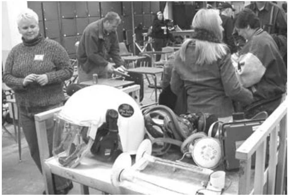
An assortment of 3M dust protection products were on display at the meeting for members to examine. N95 rating is likely the best for woodturning exposures.

Because it is nearly impossible to collect all air borne hazards,