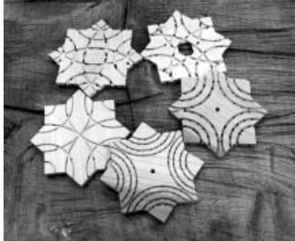
Examples of Brian's stars