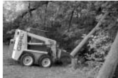
Top - John's chainsaw captured by recalcitrant trees. Bottom - Undaunted, John turned to heavy equipment to fell the tree.