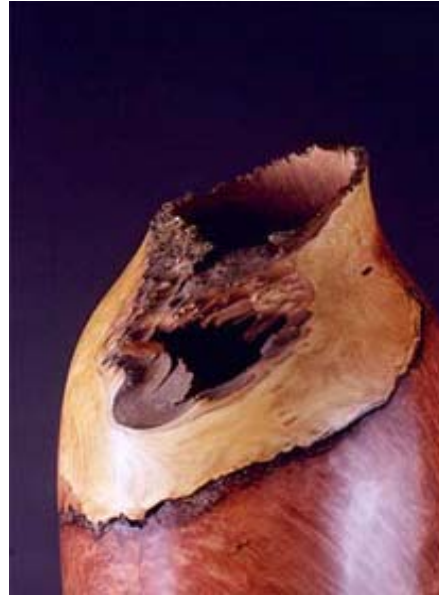
David Ellsworth "Vessel", 1989. Redwood Pitch Burl (top detail). 38"h x 11"d