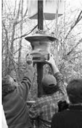
Above - MWA club's totem being mounted on the AAW totem at Arrowmont in Gatlinburg, TN