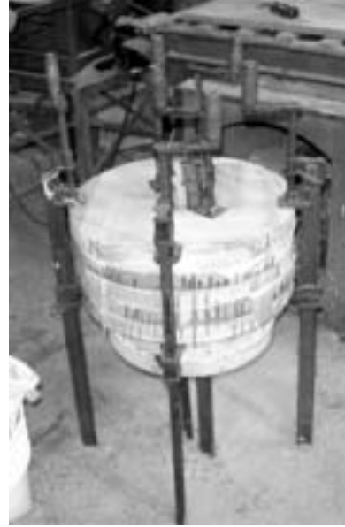
Above - Glued-up weight 75 lbs. Left, top and bottom - two of three medallions turned by Tom Shields. Woodburned designs were made by Yvonne Shields.